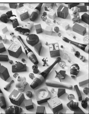
An I-Spy book. Can you find the button?

In today's Gospel reading we hear about how we have to try to search for Christ sometimes. Where? We search for Him in other people, in those around us! The Gospel tells us that when we help other people, we are helping Christ too. When we ignore other people, we are hurting Christ.