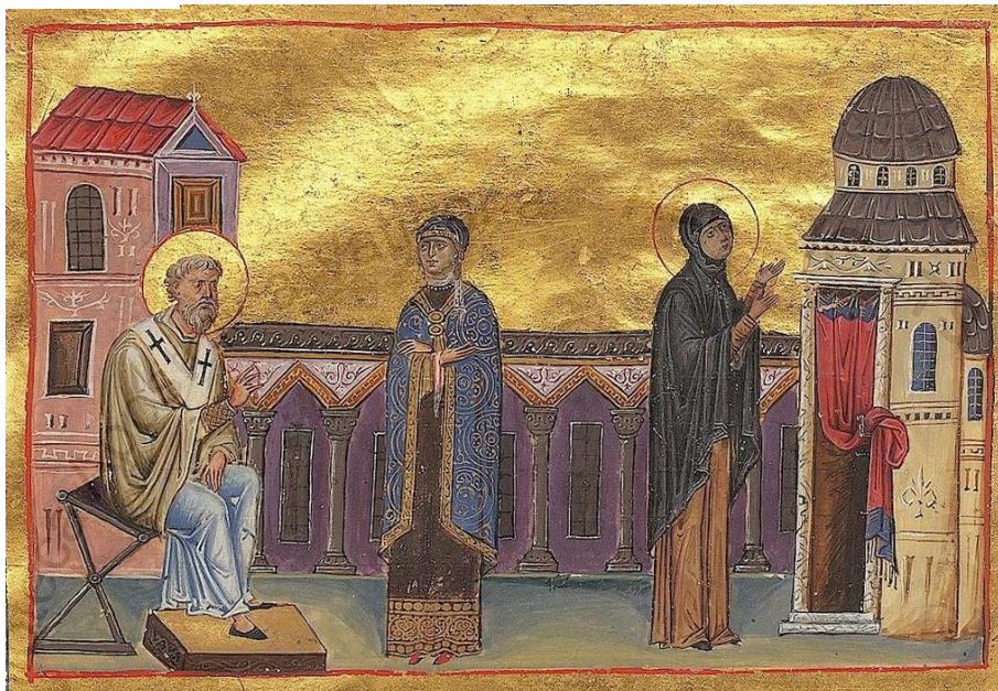
Saint Pelagia with Saint Nonnus