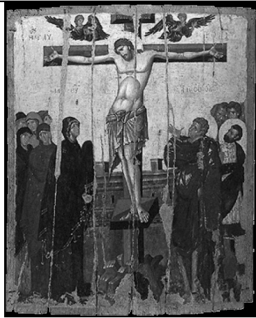
Our Lord came to save us!

When we read today's Gospel, we think about how sometimes we might even be scared of our good and loving Lord! But why? Well, maybe we might think God will punish us for doing something