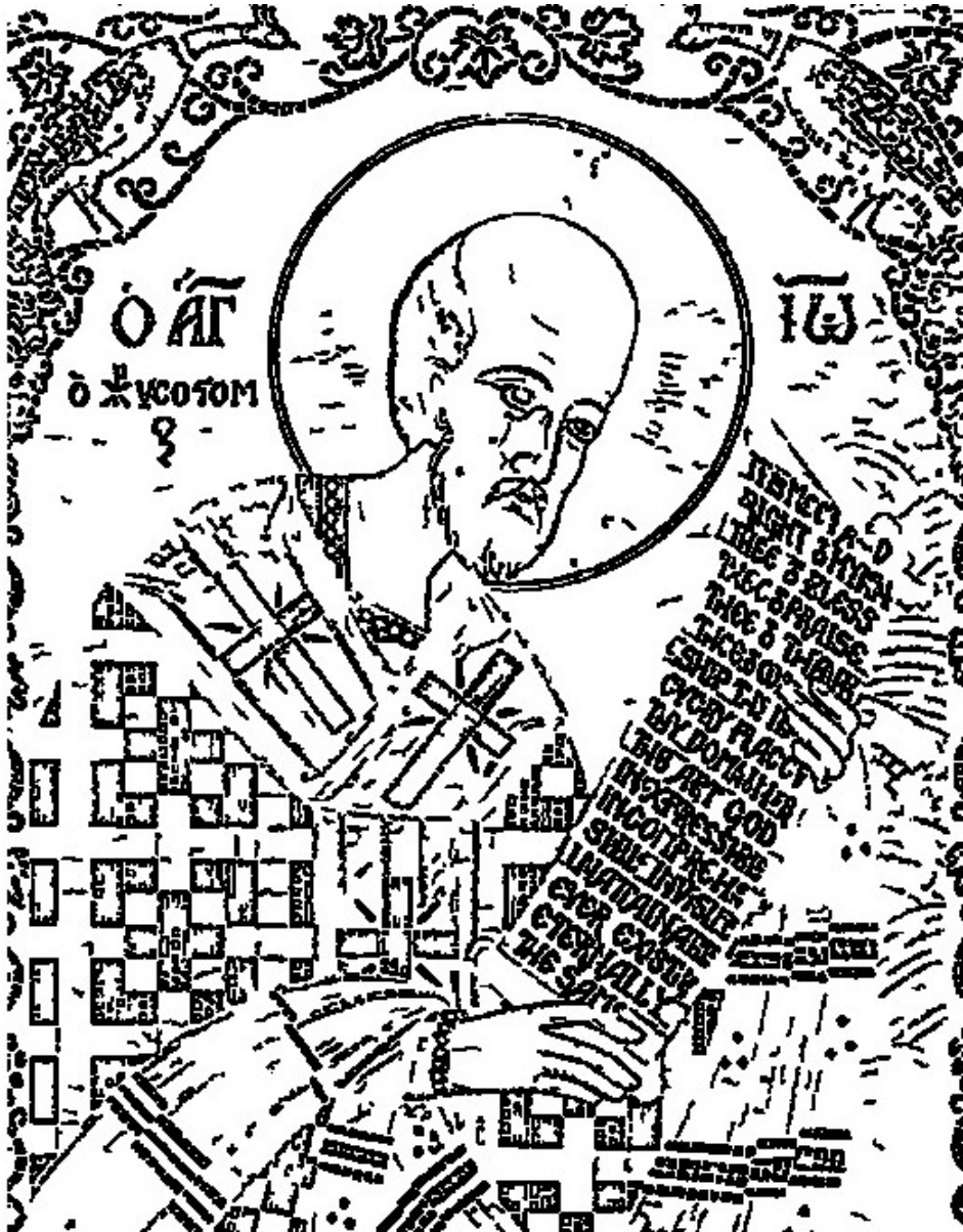
The Children’s Word is a weekly bulletin for Orthodox Christian young people. Email is orthodoxchildrensword (at) gmail.com. Find it each week at myocn.net.